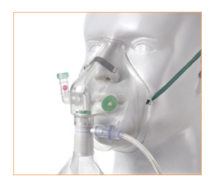
Oxygen and Aerosol Therapy • Variable Oxygen Concentration (Low Flow)