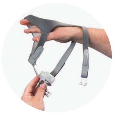
3. Support the headgear and mask.