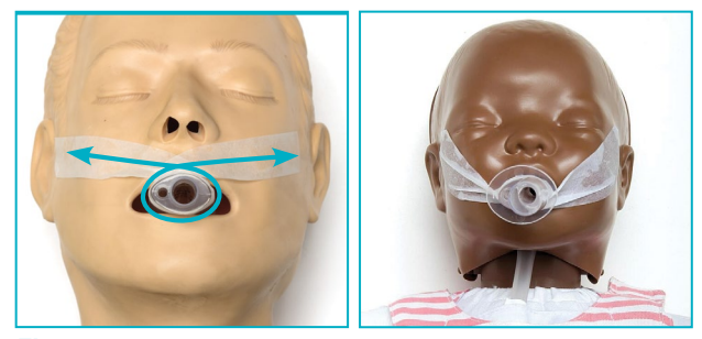
Figure 26: Fixing of the i-gel in place using adhesive tape