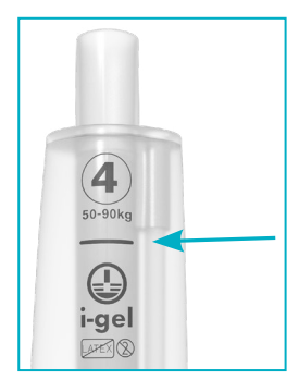
Figure 28: Ideal position of teeth - (adult sizes only)

A horizontal line (Adult sizes 3,4 and 5 only) at the middle of the integral bite-block represents the correct position of the teeth ( Figure 28 ). If the teeth are located lower than the distal tip of the bite block, then it is likely the device has been incompletely inserted. In this instance, remove the i-gel and reinsert with a gentle jaw thrust applied by an assistant. If that does not resolve the problem, use one size smaller i-gel . The paediatric sizes of i-gel (sizes 1 to 2.5) do not have a horizontal line on the integral bite block. This is due to the greater variability in the length of the oro-pharyngeal-laryngeal arch in children. As a result, insertion should continue, as with the adult sizes, until definitive resistance is felt. Once it has been established that ventilatory parameters are satisfactory and there is no leak through the gastric channel (except size 1 which does not contain a gastric channel), the i-gel should be held in place whilst the device is secured with tape 'maxilla to maxilla' ( Figure 26 ).