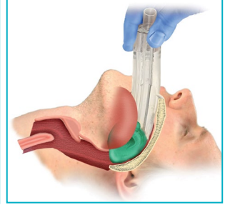
Figure 24: Deep rotation