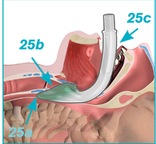
Figure 25: Correct placement of the i-gel