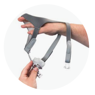
3. Support the headgear and mask.