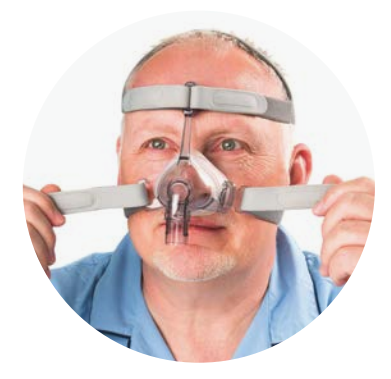
Complete the mask fitting by unfastening the lower straps, pulling both evenly and then reattaching. The fit should be secure but not over tight.