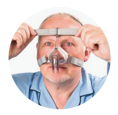
Adjust the mask fitting by unfastening the upper straps, pulling both evenly and reattaching to the headgear. The fit should be secure but not over tight.