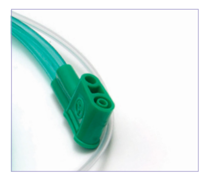
Anaesthesia • Patient Spirometry Sets